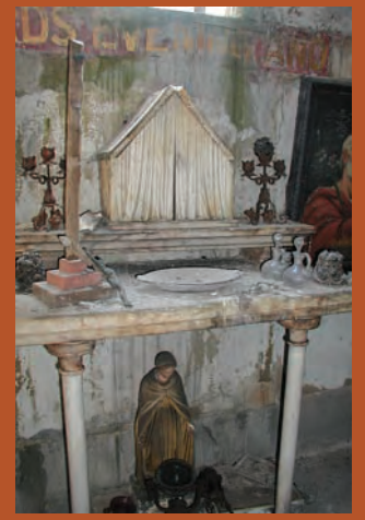
Altar and tabernacle